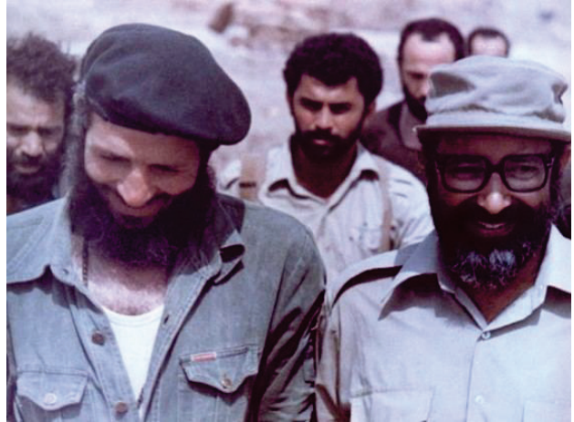
Mostafa Chamran (right) (1 st minister of Defence)