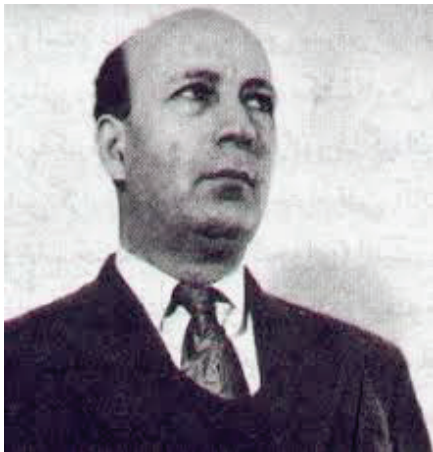
Khalil Maleki, Socialist Politician

It is not possible to fully explore the long history of a significant moment in life-cycle of GCIS (1960-1979). However, I am confident that GCIS was acting as a miniature version of Iran's civil society, revealing the internal conflicts of Iran's pre-revolution attempts to find a way to collaborate effectively in order to defeat the Shah.