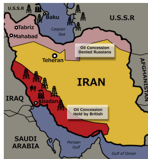
Oil concession by British and Russians